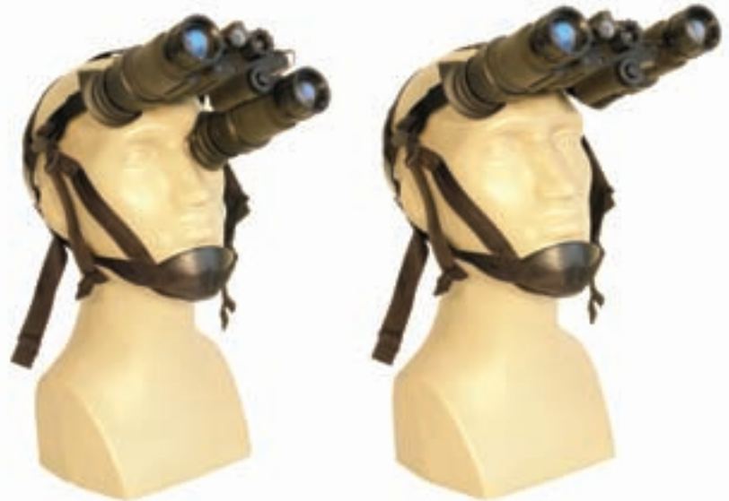
Use as a monocular